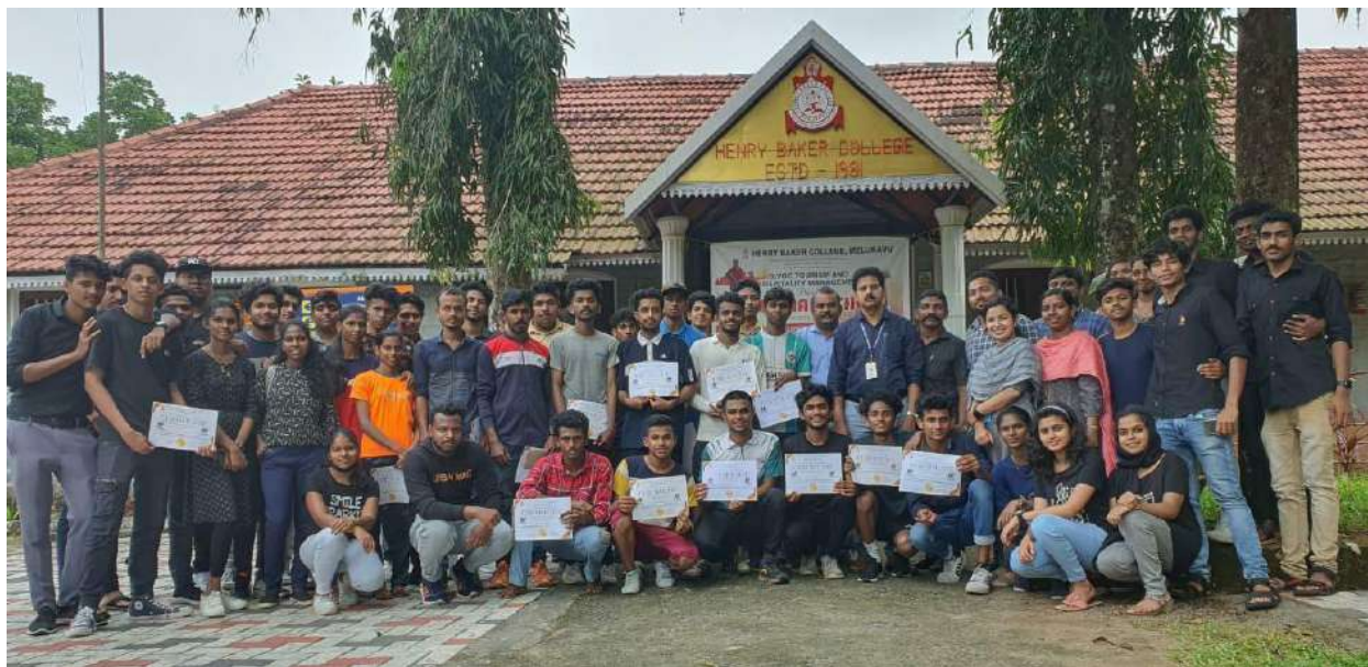
Minimarathon Participants with organizing Team