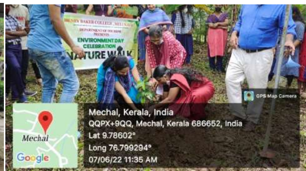
Planting of saplings at CMS High School, Mechal and Govt. School Mechal